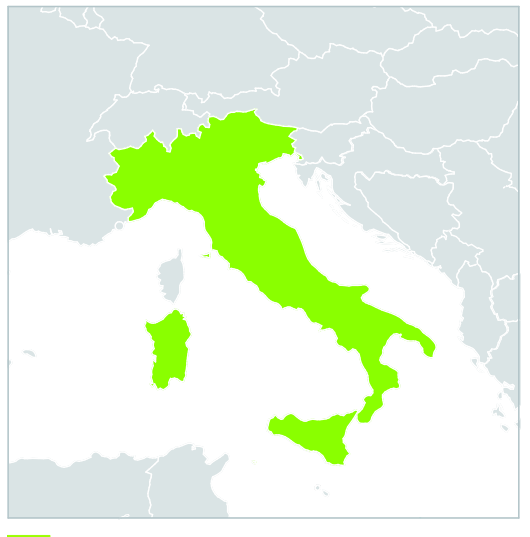
{\sim}100 % detailed street network